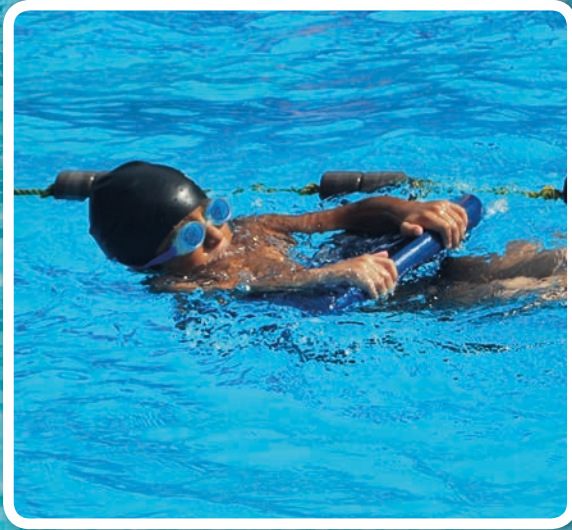
Sea Spray Swimming Pool