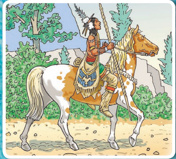
The Fox and the Boastful Brave